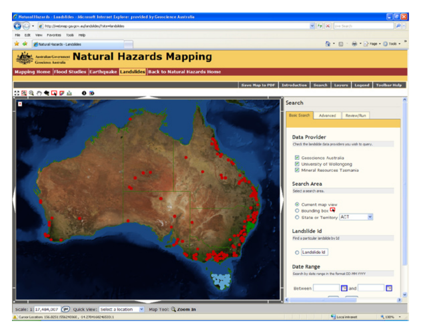
Figure 2. User interface for the virtual Australian Landslides Database displaying a spatial index of data accessed from host databases.

Users of the database can select the number of databases to be included in their landslide query and have the option of executing a basic or advanced level search. The user can define the spatial extent of their search in several ways by: searching the map extent, drawing