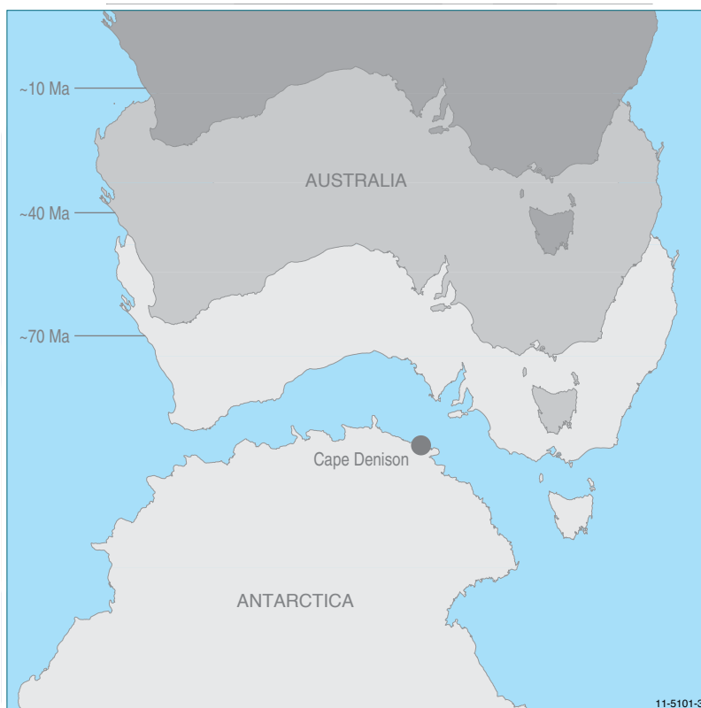
Figure 4. The separation of Australia from Antarctica, which began about 85 to 80 million years ago, was the last major geological event in the breakup of the supercontinent of Gondwana.