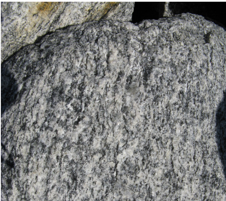
Figure 3. The Cape Denison Orthogneiss, one of the two dominant rock types found at Cape Denison.

The other major rock type found at Cape Denison is amphibolitized mafic dykes (Stillwell 1918). These mafic dykes are between about 0.1 metre to 2 metres wide, dark green/grey in colour and generally planar in outcrop. The dykes are sub-parallel to the regional foliation, and are strongly foliated. Sheraton et al (1989) concluded, on the basis of geochemistry, that at least three distinct generations of mafic dykes are present but were recrystallised and deformed during the regional amphibolite-facies metamorphism.