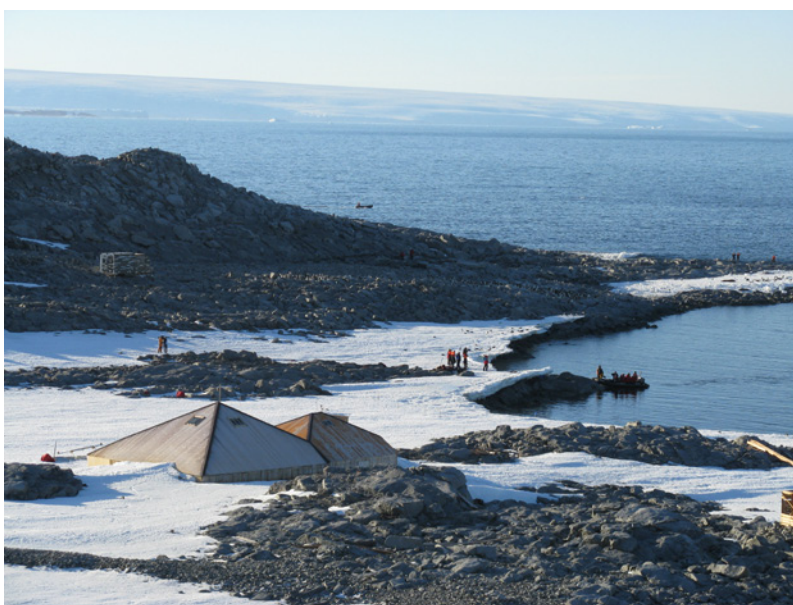
Figure 2. Cape Denison, facing northwest, overlooking Mawson's Hut from the 'Proclamation Plaque' site.