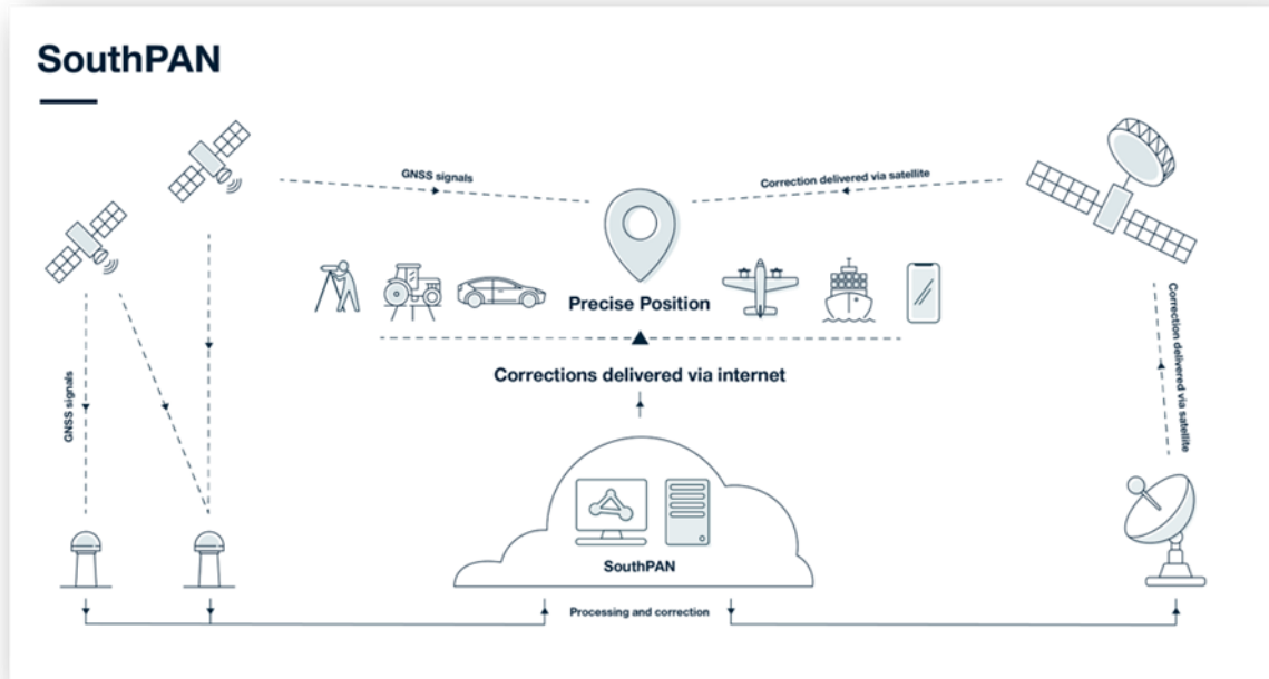
Figure 2: SouthPAN System Architecture