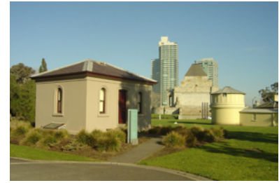
Figure 1. The Old Melbourne Observatory 'Magnet Hut' (left), near the Shrine of Remembrance (background) and tramlines along St Kilda Road.

phone Adrian Hitchman on +61 2 6249 9800 email adrian.hitchman@ga.gov.au .