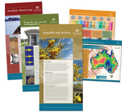
Figure 1. Some of the display material relating to earthquake monitoring and data acquisition in the Dalwallinu area prepared by the graduate team.

The interaction between members of the local community and the graduates during the community presentations and the field trip has strengthened relations between Geoscience Australia and the Shire of Dalwallinu. Members of the Shire Council were particularly impressed by the team's professional and engaging manner in their