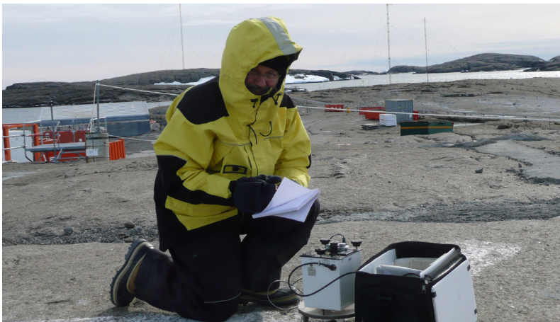
Figure 1. Ties between existing gravity base stations and the new absolute gravity base stations were conducted using a relative gravity meter.

Transport to and from the Antarctic stations was onboard the Australian Antarctic Division's re-supply vessel RSV Aurora Australis , which departed Hobart on 25 January 2010 and returned on 28 February 2010. The ship's track for this voyage and the location of Davis and Mawson can be seen in figure 2.