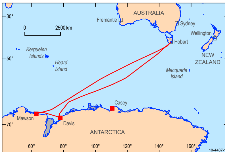
Figure 2. Map showing the location of Davis and Mawson in relation to Australia and the track of the RSV Aurora Australis during Voyage 3, 2009–10.