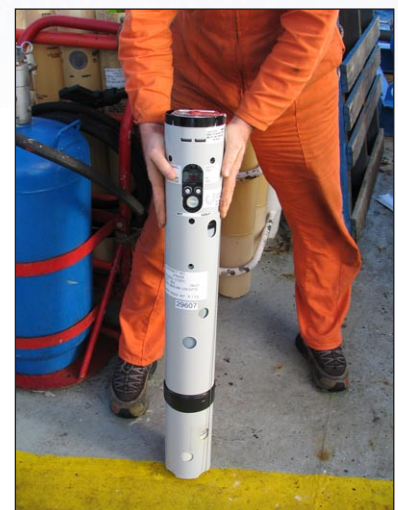
Detail of a sonobuoy before launch