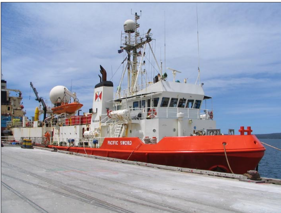
MV Pacific Sword , the seismic acquisition vessel contracted from Veritas by Geoscience Australia for the Southwest Frontiers survey

The seismic acquisition involved deployment of sonobuoys at sea and recording stations on land. The land stations were placed along the onshore continuation of three key survey lines (figure 1) to record refractions from the seismic vessel's energy source—a 4900 cubic inch air gun array.