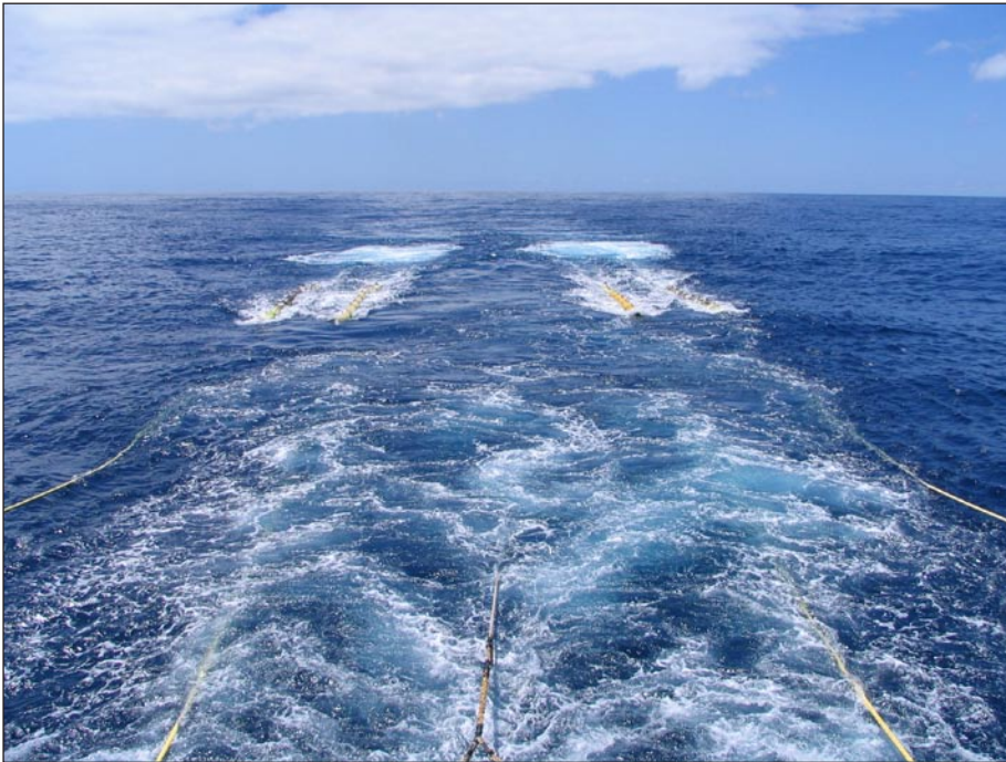
View astern from the deck of the Pacific Sword during seismic collection