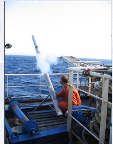
Launching a sonobuoy from the deck of the Pacific Sword .

The survey will also provide the first deep seismic reflection data (> 6 seconds two-way time) in the Vlaming Sub-basin. This data will be integrated with a 2000-kilometre grid of recently reprocessed data to improve our understanding of the geology and petroleum prospectivity of the sub-basin.